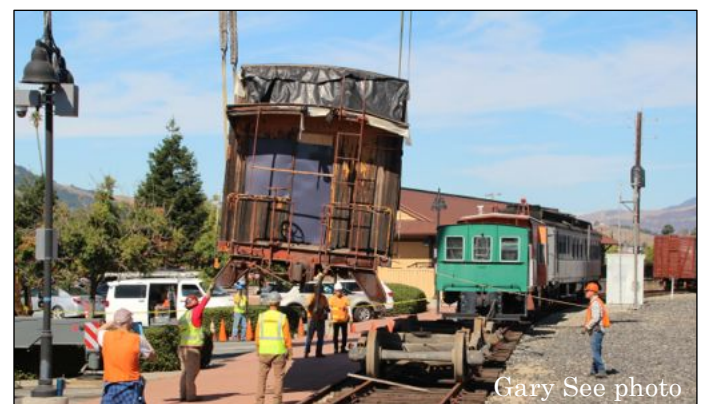
Gary See photo