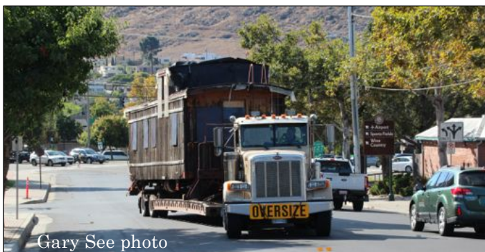
Gary See photo