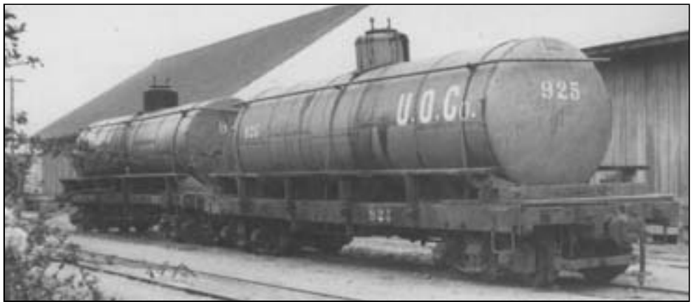
Figure 3: Tank car #925 lettered U.O.Co. for the Union Oil Company, Santa Maria, 1938.

8 Other noted fields were developed at Palmer and Cat Canyon southeast of Santa Maria and the PCRY extended a branch line