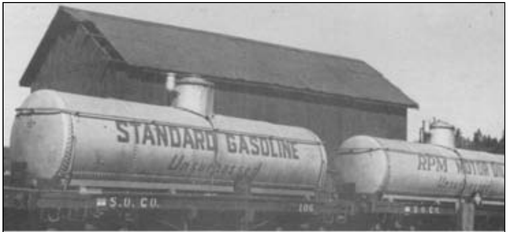
Figure 4: Standard Oil owned tank cars for refined retail product with advertising on the sides. These cars were numbered X-106 and X-107.