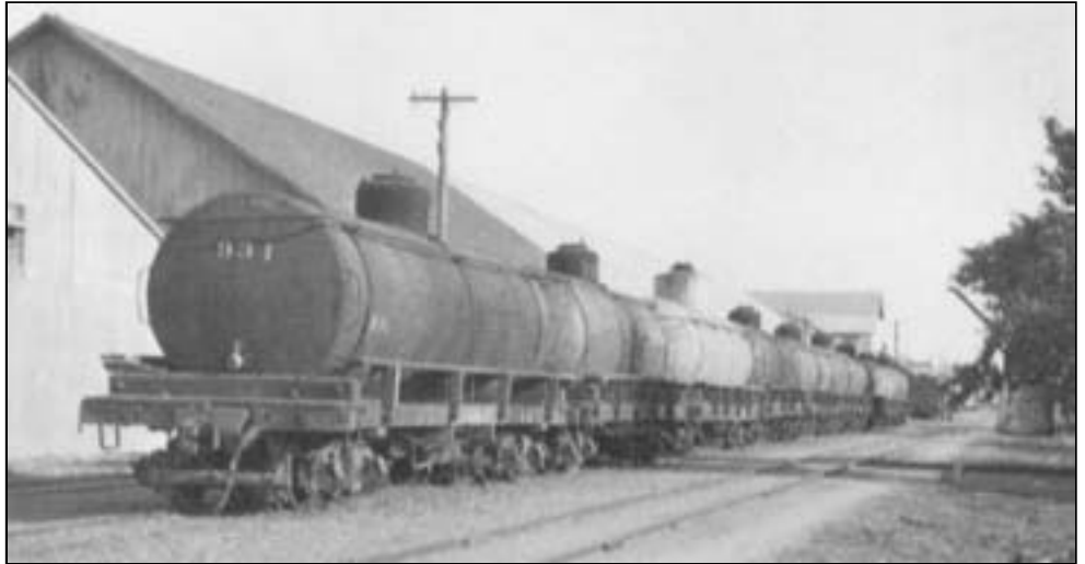
Figure 1: A string of steel tanks on narrow gauge flatcars at Santa Maria in 1939.

By the time the tanks arrived by steamship at Port Harford a series of flatcars had been outfitted to create a fleet of homemade tanks cars. In addition to meeting the demand for a new