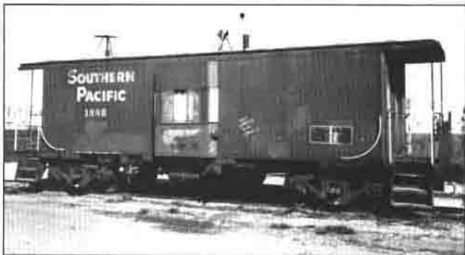
Ex-SP Caboose 1886